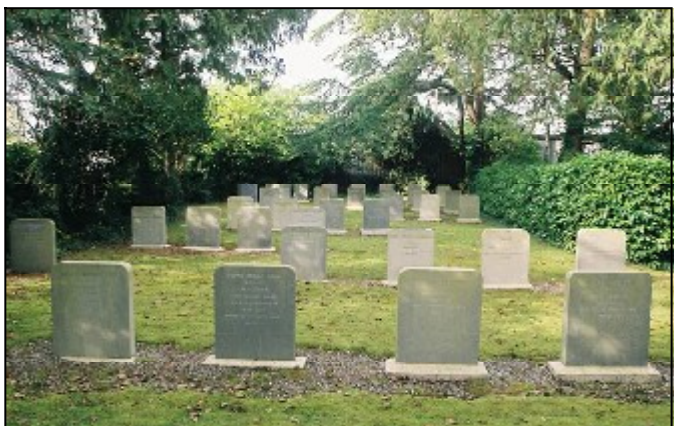
The Quaker burial ground.