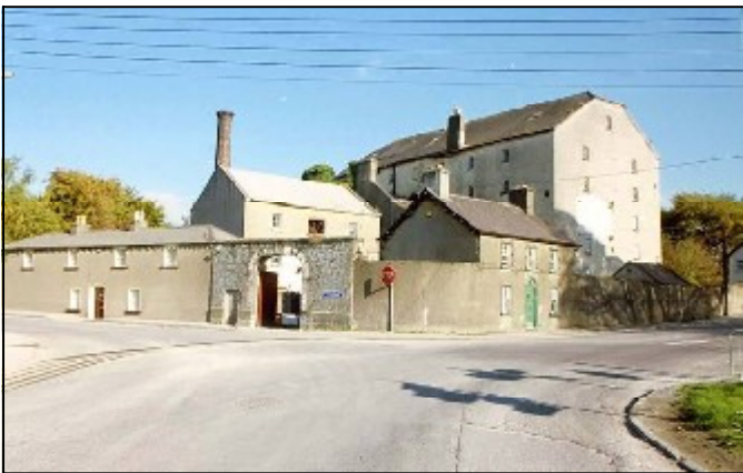
Erry Mill, the largest surviving mill in Co Offaly.