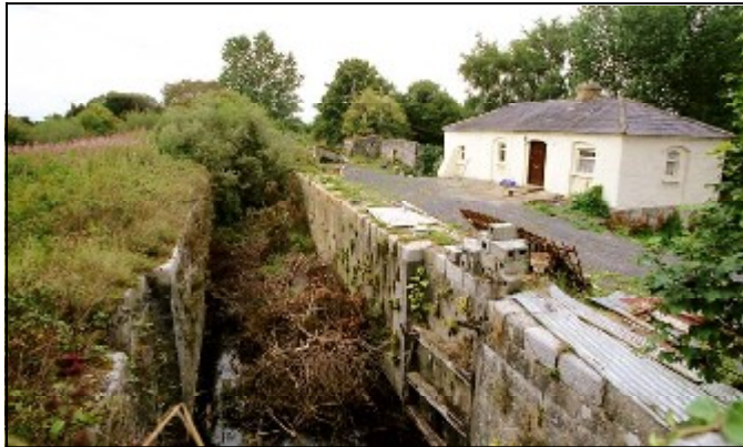
The abandoned first lock and still-inhabited lock-keeper's house on the Monasterevin-Portarlinton road.

The full report and site inventory can be accessed on line at www.laois.ie/LeisureCulture/Heritage/HeritagePublications . Because of the large file sizes, a broadband rather than a dial-up connection is recommended for downloading.