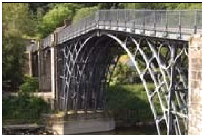
The aptly named Iron Bridge over the River Severn. This was the world's first cast-iron bridge, opening in 1779.

Friday will be spent at the various industrial museums at the World Heritage Site of Ironbridge (for a taster of what we can expect to see, go to www.ironbridge.org.uk ).